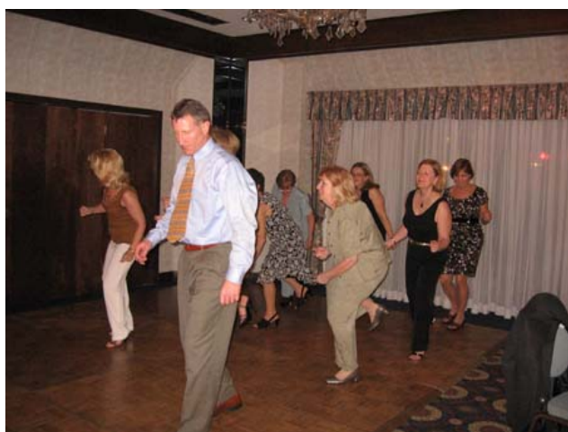
The Annual Banquet .... Dave's Girls

Deposit of $350 now (to reserve space) Second deposit of $350 due 6/01/09 Final payment (balance) due 9/01/09 Make Checks Payable to: PPL GOEAC